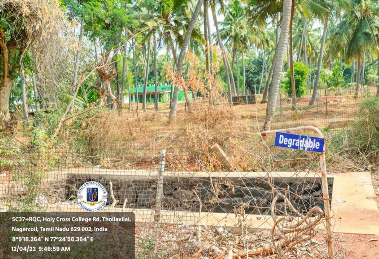
5C37+RQC, Holy Cross College Rd, Thollavilai, Nagercoil, Tamil Nadu 629 002, India 8°9'18.264" N 77°24'56.364" E 12/04/23 9:46:59 AM