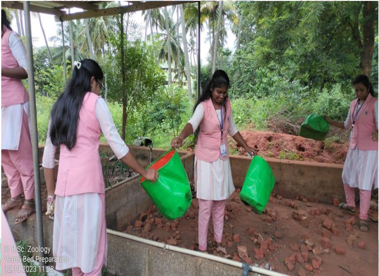
III B.Sc. Zoology Vermi Bed Preparation 12.10.2023 11:28