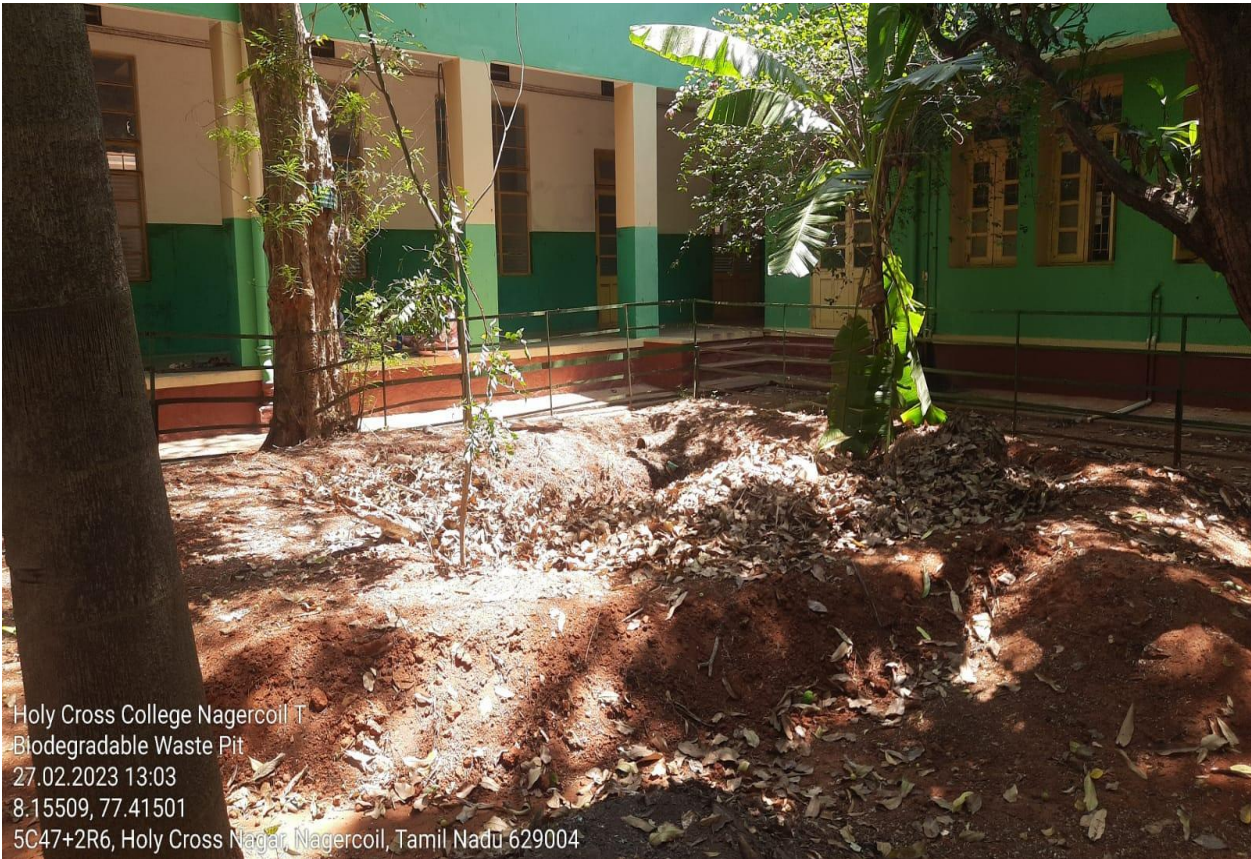
Holy Cross College Nagercoil T Biodegradable Waste Pit 27.02.2023 13:03 8.15509, 77.41501 5C47+2R6, Holy Cross Nagar, Nagercoil, Tamil Nadu 629004