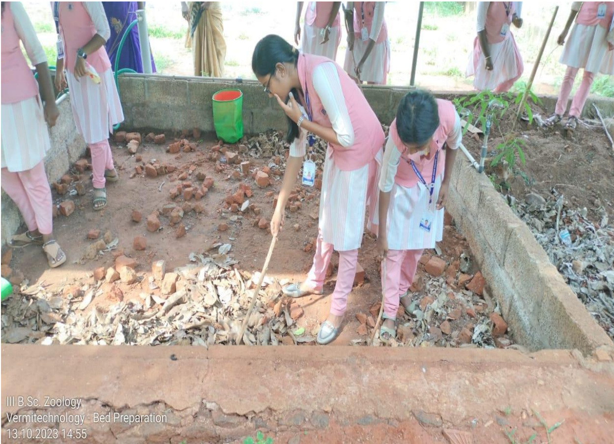
III B.Sc. Zoology Vermitechnology - Bed Preparation 13.10.2023 14:55