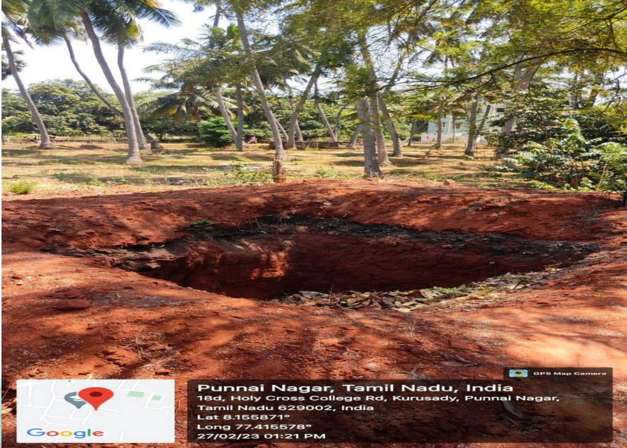
WASTE DUMP YARD

5C37+RQC, Holy Cross College Rd, Thollavilai, Nagercoil, Tamil Nadu 629 002, India 8°9'18.93" N 77°24'53.838" E 2024-03-27T12:25:45.001