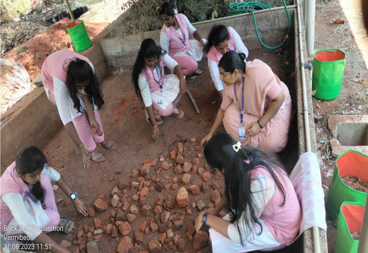
Brick Bed Preparation Vermibed 31.08.2023 11:51