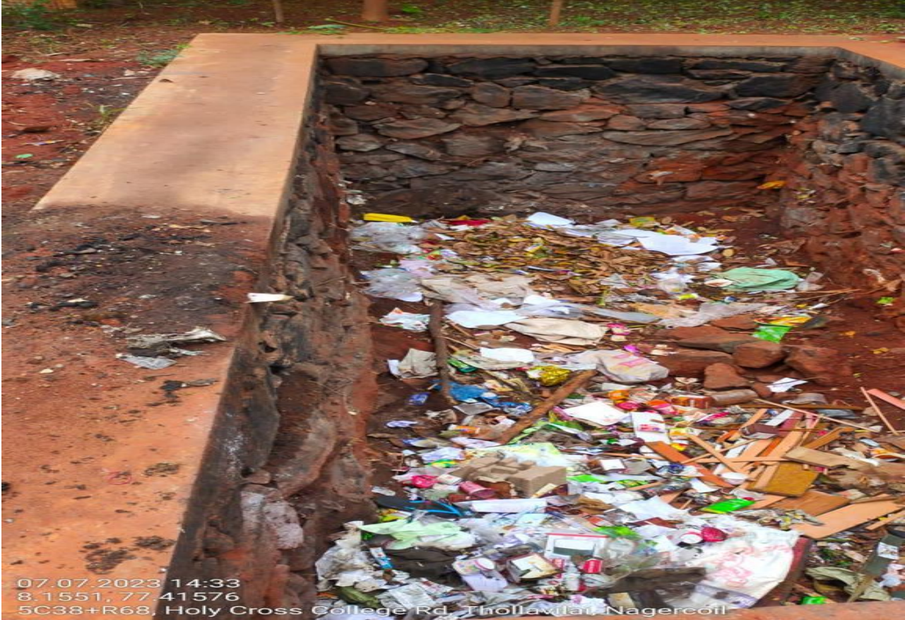
ESTD DEGRADABLE WASTE 1965