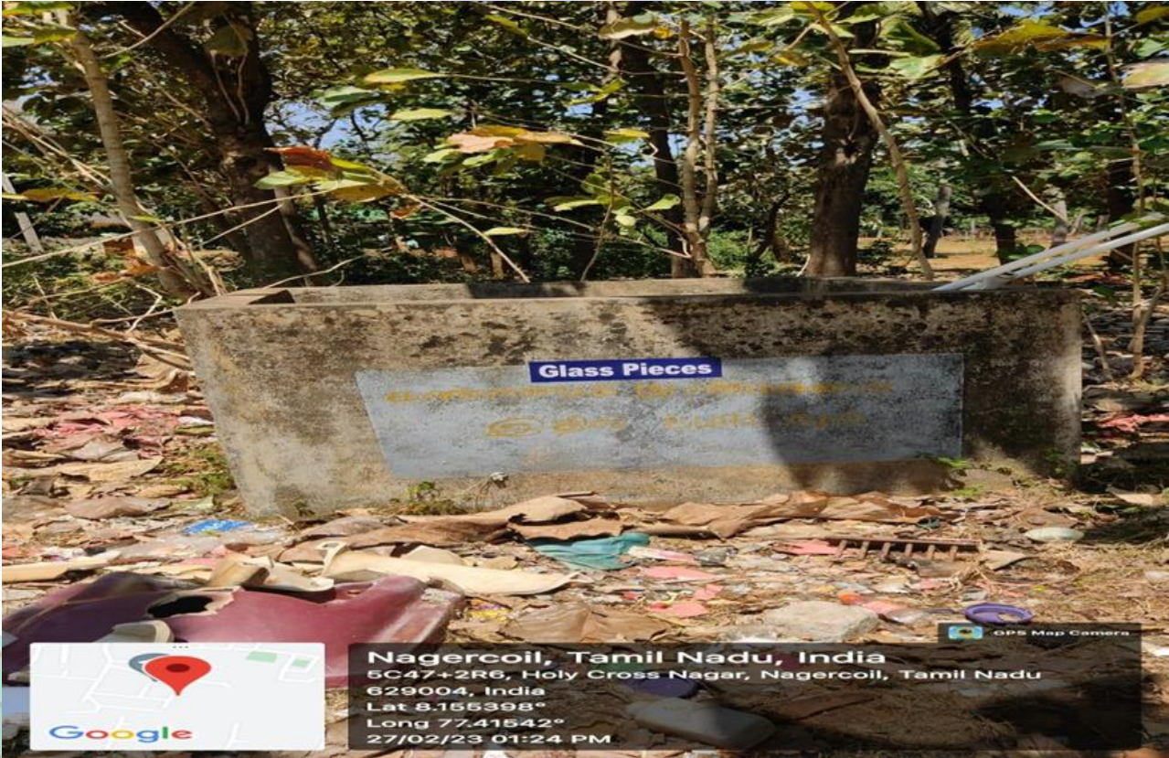
ESTD 1965 GLASS PIECES DUMP YARD

Nagercoil, Tamil Nadu, India 5C47+2R6, Holy Cross Nagar, Nagercoil, Tamil Nadu 629004, India Lat 8.155398° Long 77.41542° 27/02/23 01:24 PM