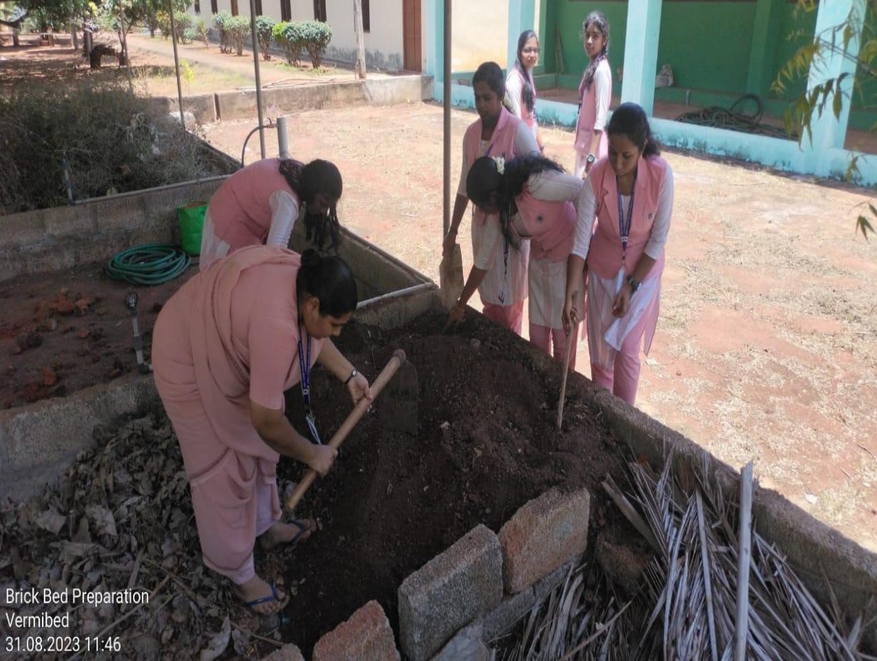
Brick Bed Preparation Vermibed 31.08.2023 11:46